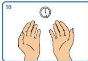
10 The process should take 15–30 seconds