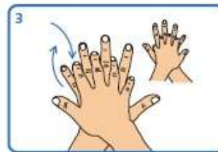
3 Rub back of each hand with palm of other hand with fingers interlaced