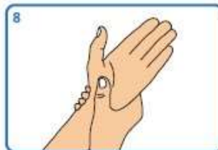
8 Rub each wrist with opposite hand