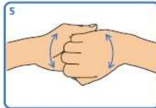
5 Rub back of fingers to opposing palms with fingers interlocked