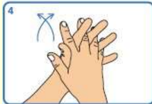
4 Rub palm to palm with fingers interlaced