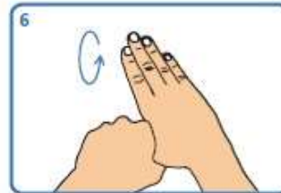
6 Rub each thumb clasped in opposite hand using a rotational movement