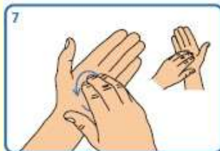
7 Rub tips of fingers in opposite palm in a circular motion