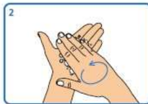
2 Rub hands together palm to palm, spreading the handrub over the hands