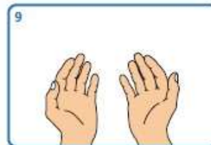
9 Wait until product has evaporated and hands are dry (do not use paper towels)